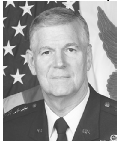
Richard Myers, President of Kansas State University